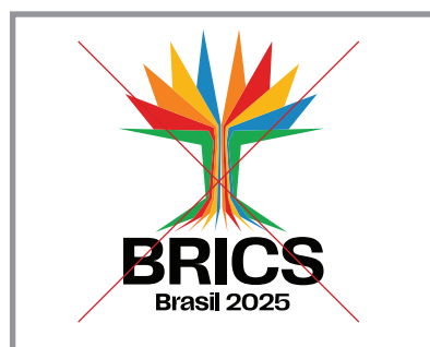
Não aplicar molduras