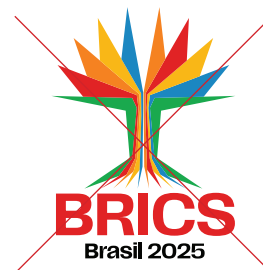
Não modificar as cores