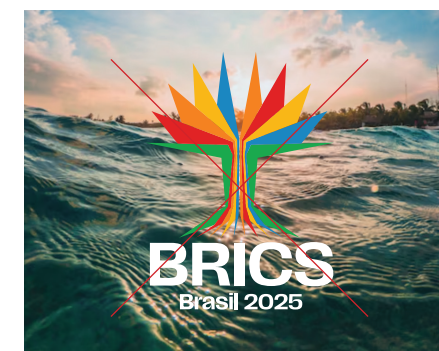
Não aplicar diretamente sobre fotos