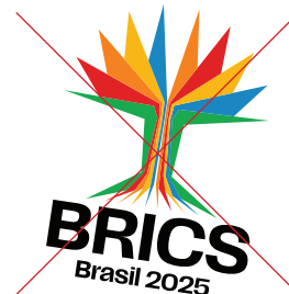
Não inclinar a marca