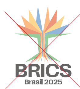
Não usar como marca d'agua