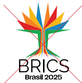
Não alterar tipografia

The BRICS logo must not appear in alternative colors, with additional borders, or distorted text. Any structural or chromatic changes are prohibited to maintain logo consistency.