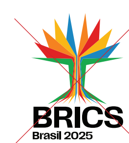
Não alterar alinhamento