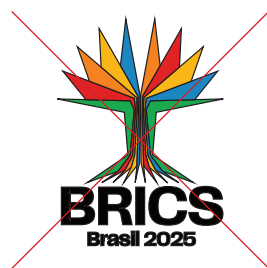
Não aplicar outlines